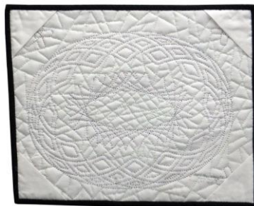
View of back of artwork