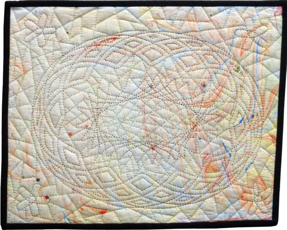
Exhibition and Publication History

Aged Psychedelic #5 (13.75" x 17"/ 34 x 43cm) (c) 2017-2020 Jean M. Judd/Artists Rights Society (ARS) New York Hand Stitched Thread on Hand Marbled Textile **Available for Purchase - $2,300**