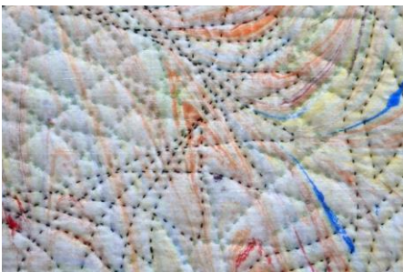
Detail image of artwork

This piece is designed to be displayed in a horizontal or vertical orientation and will be spectacular paired up with several of the other pieces in this series.